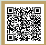
Group Tour Request Form

Email questions to: tours@muskegonartmuseum.org