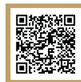
Field Trip Request Form