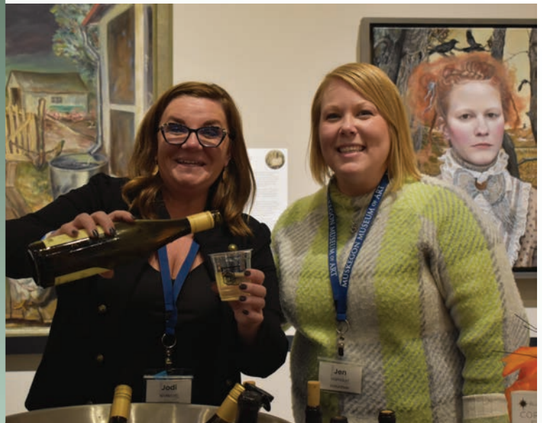
* MMA BOARD TRUSTEE