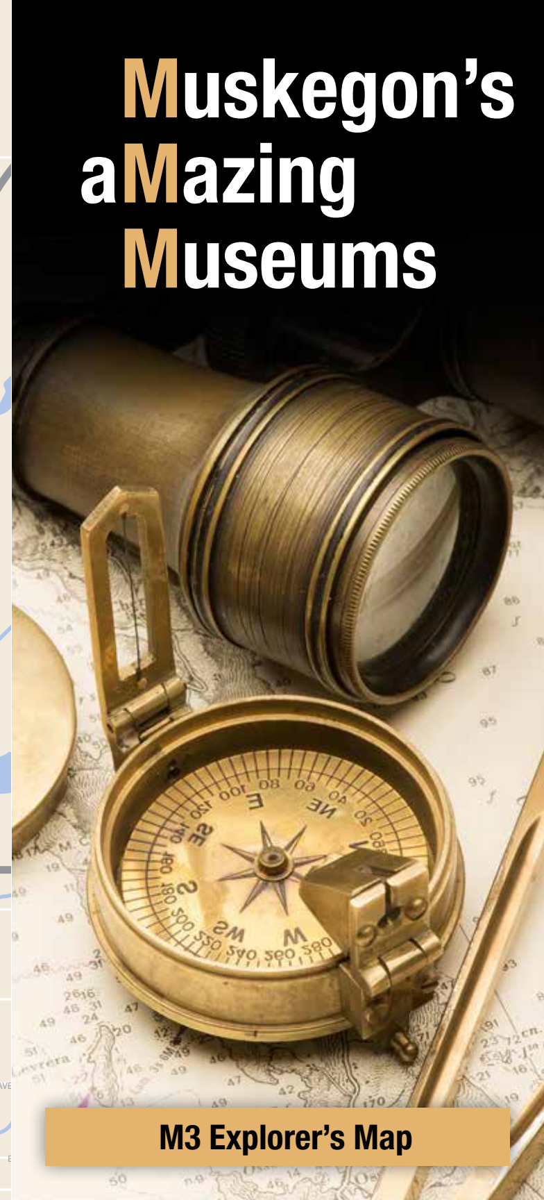
M3 Explorer's Map