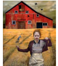
Andrea Kowch (born 1986) Dream Chaser acrylic on canvas, 60" x 48" 2013