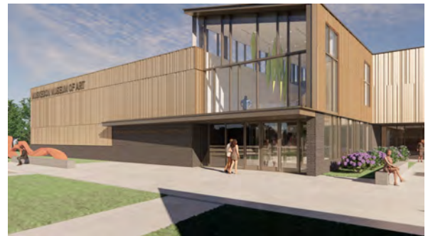
Architectural rendering of the Muskegon Museum of Art Expansion